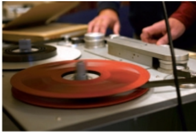
Machines which can play the half-inch, four channel tapes are available, as is information concerning track contents and layout.

The basic question was, how could two rear channel signals be integrated into normal stereo sound systems without alienating the old customers? Mixing rear channel information into the